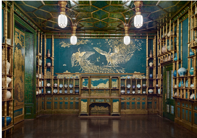
Figure 5. James McNeil Whistler. The Peacock Room. 1877. Freer Gallery of Art, gift of Charles Lang Freer.

lessons from William Morris' Arts and Crafts Movement, which had sought to reform design and decoration. While Whistler regarded spatial art as a visual music, he had largely, notwithstanding his decorative panels, confined himself to painting, faithfully respecting the traditional definition of Fine Arts. Dow was convinced that in his Composition he had gone beyond Whistler, and achieved "synthetic exercises" of fine arts and design over the course of his life-long artistic career.