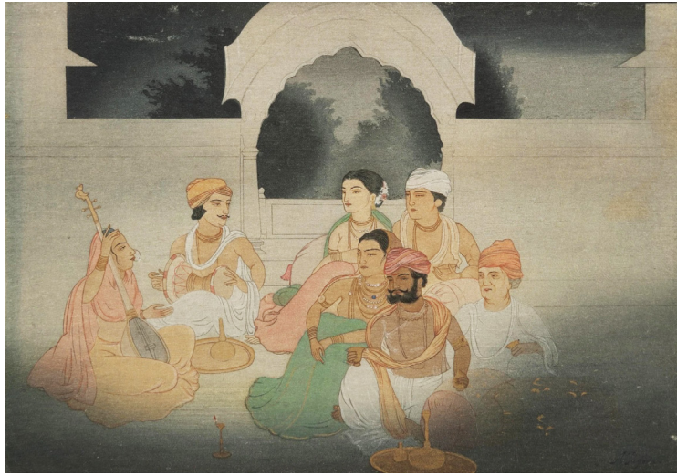
Figure 3. Abanindranath Tagore. Music Party, also called Nocturne. 1908. Woodblock print reproduction published in Kokka 國華 226, 1909.

Yet the experience of the Bengal School shows that what Whistler pursued and the Japanese mōrōtai intended were neither identical nor equivalent. Even if similar in outcome, their vectors were in opposite directions. Whistler, guided by his highly personal aestheticism, tried to “Orientalize” his oil painting by deviating from Western academic rules. On the other hand, Yokoyama and Hishida tried to compete with Western oil painting. It was imperative for them to realize works worthy of appreciation in the Western market and at Westernized exhibitions. To attain this aim, and to realize similar pictorial effects, they renovated their own traditional techniques based on glue paste ( nikawa 膠). They also made use of shell powder ( gofun 胡粉) in order to enhance the thickness of pigment on the pictorial plane.