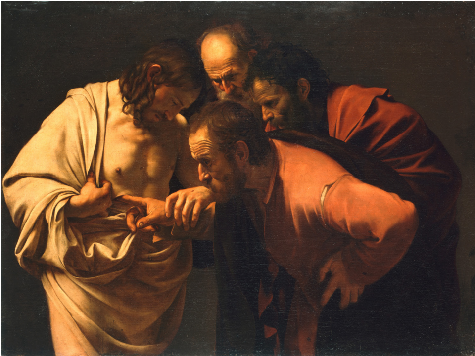
Figure 1. Michelangelo Merisi da Caravaggio. The Incredulity of Saint Thomas . 1601. Fenollosa contrasted the “extravagance” of Caravaggio’s chiaroscuro, or contrast between light and shade, visible in paintings like this one, with the total harmony of nōtan . Property of the Sanssouci Picture Gallery, Potsdam. Image courtesy of the SPSG Painting Collection, Prussian Palaces and Gardens Foundation Berlin-Brandenburg (GK I 5438).