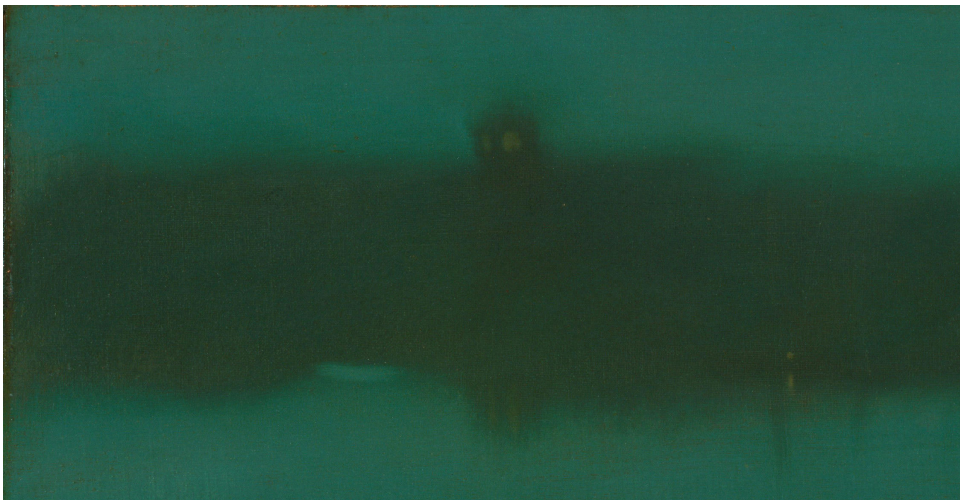
Figure 2. James McNeil Whistler. Nocturne: Grey and Silver . 1875–1880. Oil on canvas, Part of the John G. Johnson Collection, 1917. Cat. 1111.