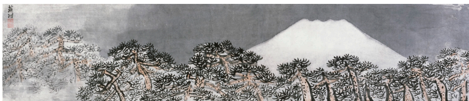
Figure 7. Yosa Buson 与謝蕪村. Fugaku Resshō zu 富嶽列松図 ( Mount Fuji seen beyond Pine Trees ). 1778–1783. Aichi Prefectural Museum of Art (Kimura Teizo Collection) 愛知県美術館 (木村定三コレクション).

Occident by at least two hundred years,” arguing that “the superiority of the East to the West in the art of painting would turn out to be evident” if one “put a Cézanne side by side with a Yosa Buson” (figure 7). 47