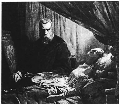
Figure 2. Léon Cogniet, Tintoretto peignant sa fille morte , 1843. Oil on Canvas, 143 x 163 cm. Bordeaux, Musée des Beaux-Arts.

And she adds: "Et la jeune femme pleura, car c'était un présage de mort." The last phrase is almost superfluous, as every reader of "The Oval Portrait" by Edgar Allan Poe already has a foreboding of her death. The following phrase only reinforces this prediction: "Depuis que Ling préférait les portraits que Wang-Fô faisait d'elle, son visage frémissait, comme la fleur en butte au vent chaud ou aux pluies d'été". The reader already feels a certain déjà vu : the hanging of Claude in Émile Zola's l'Oeuvre . And indeed this expectation will not be disappointed. In the next phrase we read "Un matin, on la trouva pendue aux branches du premier rose: les bouts de l'écharpe qui l'étranglait flottaient mêlés à sa chevelure". Reminiscence of Pelleas et Mélisande , of course, which will be repeated when the Imperial Hall was inundated by the magical water: "les tresses des courtisans submergés ondulaient à la surface comme des serpents, et la tête pâle de l'Empereur flottait comme un lotus".