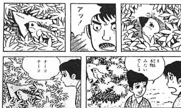
Figure 5. Yoshiharu Tsuge, "Chiko", Yoshiharu Tsuge zenshû, vol. 4, Tokyo: Chikuma Shobô, 1993.

ciless mutability, fugitiveness and transient ephemerality of the floating world ( ukiyo ).